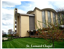
St. Leonard Chapel

St. Leonard Faith Community is a freely formed Catholic community sharing in the Franciscan heritage. We are committed to creating, through active worship and the offering of our individual and collective gifts, a spiritual environment which opens us to the life-giving presence of the Holy Spirit. Through a variety of ministries, we reach out to respond to the needs of others with love. Our mission will be to live our Christian Faith, to grow spiritually, and to be actively involved in the community and St. Leonard Faith Community.