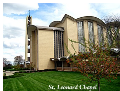
St. Leonard Chapel

St. Leonard Faith Community is a freely formed Catholic community sharing in the Franciscan heritage. We are committed to creating, through active worship and the offering of our individual and collective gifts, a spiritual environment which opens us to the life-giving presence of the Holy Spirit. Through a variety of ministries, we reach out to respond to the needs of others with love. Our mission will be to live our Christian faith, to grow spiritually, and to be actively involved in the community and St. Leonard Faith Community.