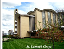
St. Leonard Chapel

St. Leonard Faith Community is a freely formed Catholic community sharing in the Franciscan heritage. We are committed to creating, through active worship and the offering of our individual and collective gifts, a spiritual environment which opens us to the life-giving presence of the Holy Spirit. Through a variety of ministries, we reach out to respond to the needs of others with love. Our mission will be to live our Christian faith, to grow spiritually, and to be actively involved in the community and St. Leonard Faith Community.