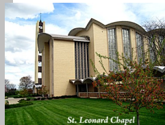
St. Leonard Chapel

St. Leonard Faith Community is a freely formed Catholic community sharing in the Franciscan heritage. We are committed to creating, through active worship and the offering of our individual and collective gifts, a spiritual environment which opens us to the life-giving presence of the Holy Spirit. Through a variety of