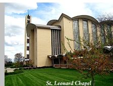
St. Leonard Chapel

Monday - Friday 9:00AM Saturday 4:00PM Sunday 9:00AM