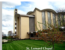
St. Leonard Chapel