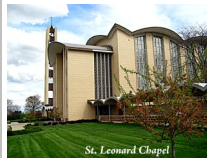
St. Leonard Chapel

St. Leonard Faith Community is a freely formed Catholic community sharing in the Franciscan heritage. We are committed to creating, through active worship and the offering of our individual and collective gifts, a spiritual environment which opens us to the life-giving presence of the Holy Spirit. Through a variety of ministries, we reach out to respond to the needs of others with love. Our mission will be to live our Christian Faith, to grow spiritually, and to be actively involved in the community and St. Leonard Faith Community.